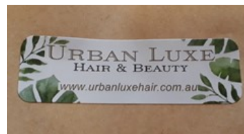
Urban Luxe Hair & Beauty