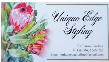
Unique Edge Styling